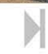
◀ Angle of View 39° Horizontal ( 50 mm Lens )