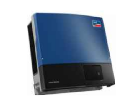
AS PER SPECIFICATION