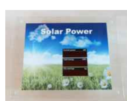
AS PER SPECIFICATION