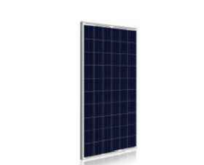
AS PER SPECIFICATION