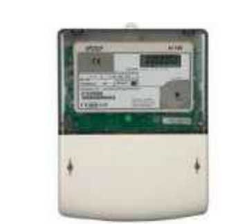
AS PER SPECIFICATION