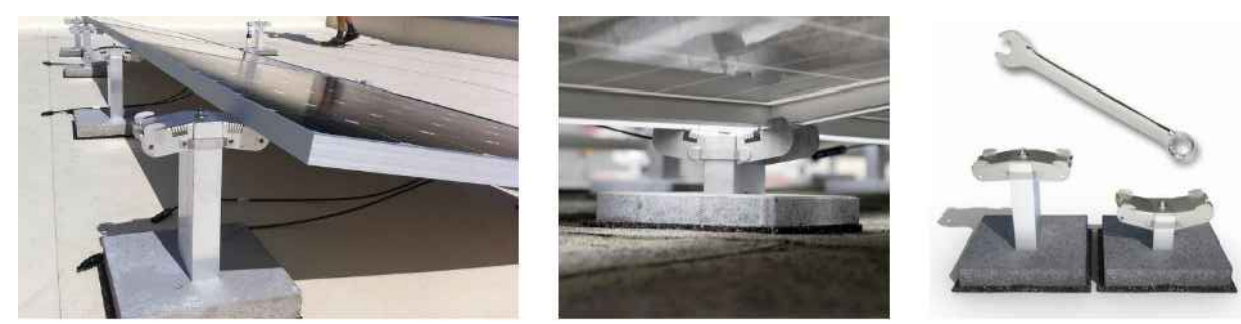
AS PER SPECIFICATION