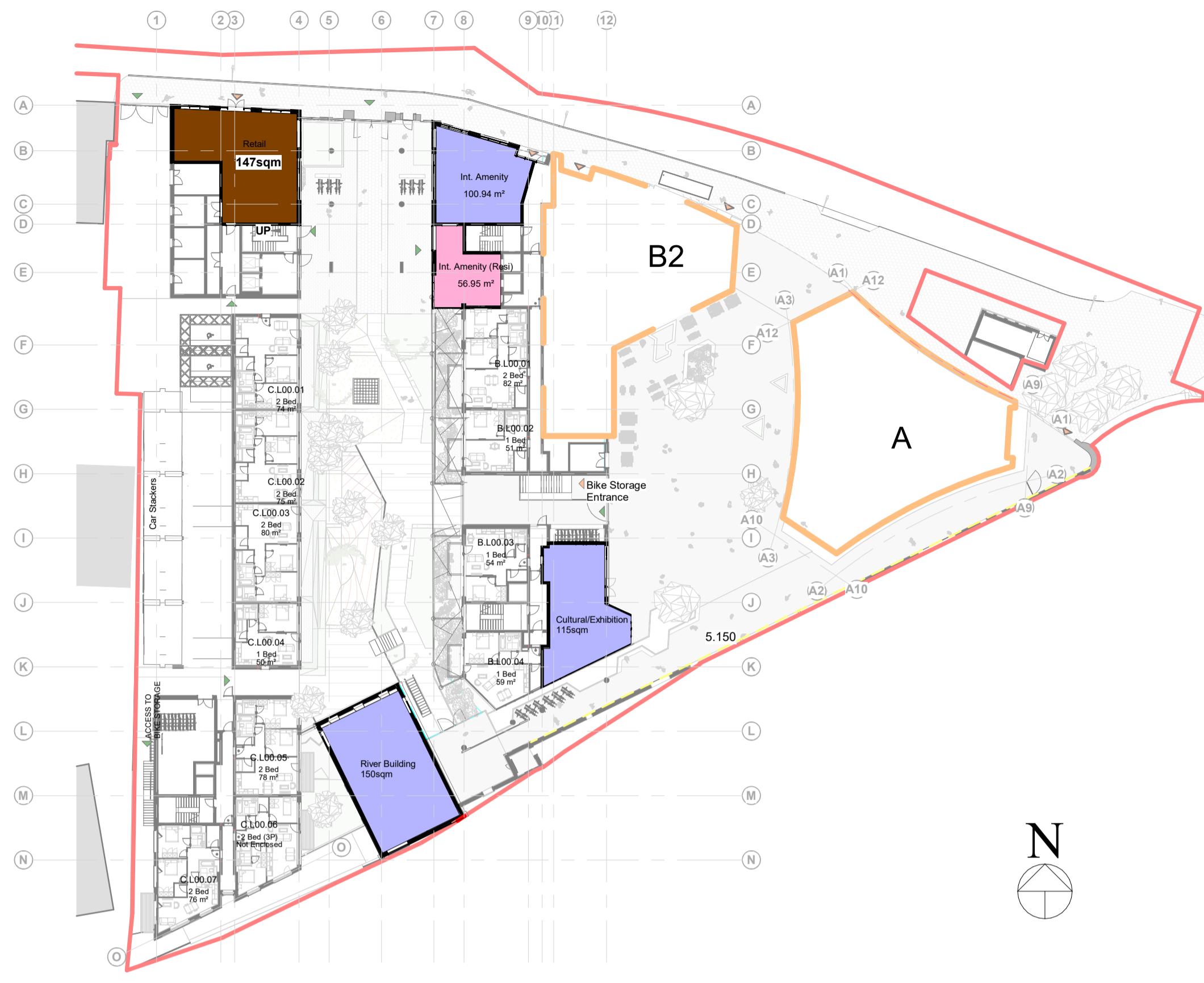
L00 - Proposed Ground Floor Plan Int. Amenity 1 : 500