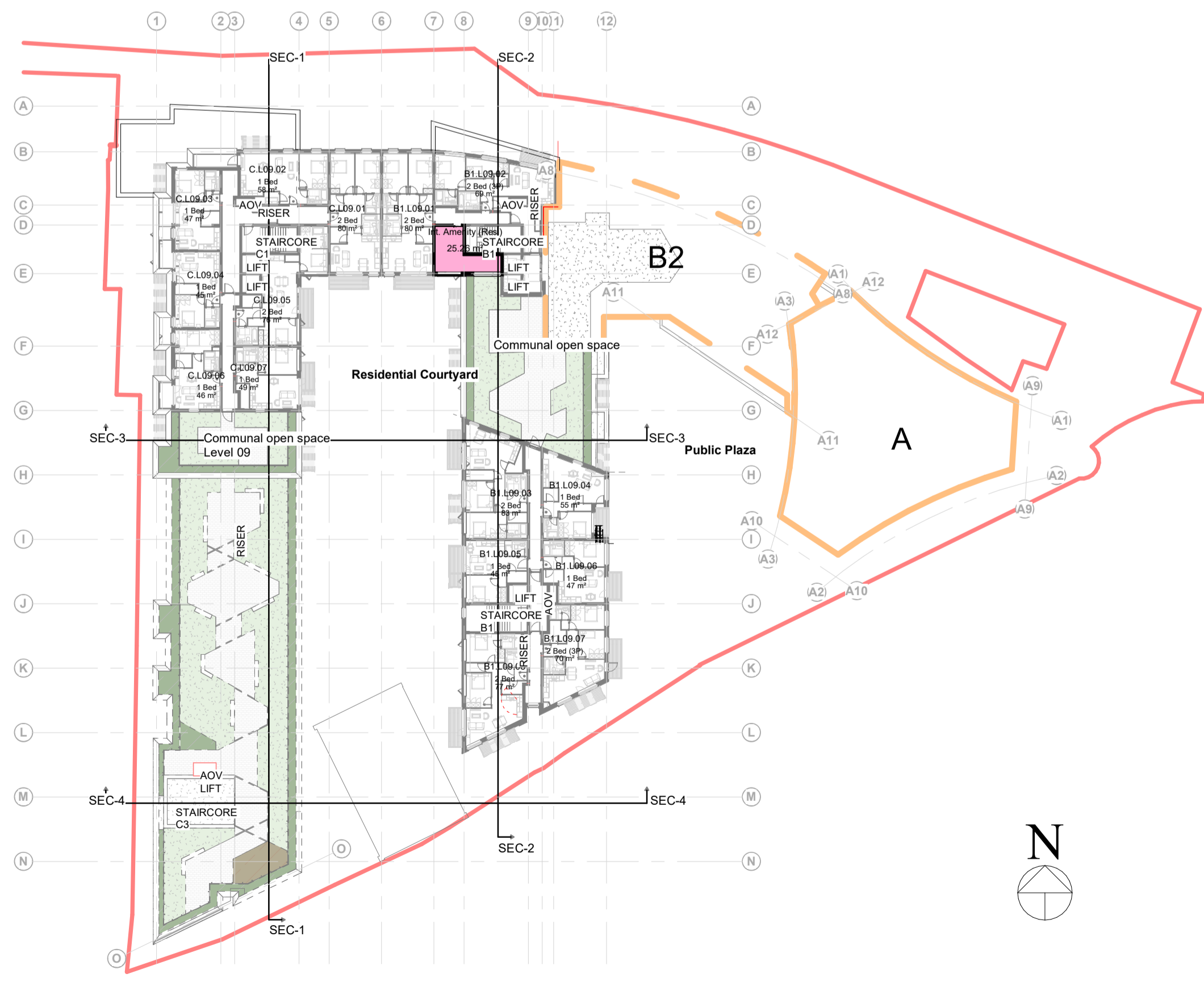
L09 - Proposed 9th Floor Plan-Internal Amenity 1 : 500

Notes: - Do not scale from this drawing. Use figured dimensions in all cases. - Verify dimensions on site and report any discrepancies to the Architect immediately. - This drawing is to be read in conjunction with the Architect's Specification. - © This drawing is copyright and may only be reproduced with the Architect's permission.