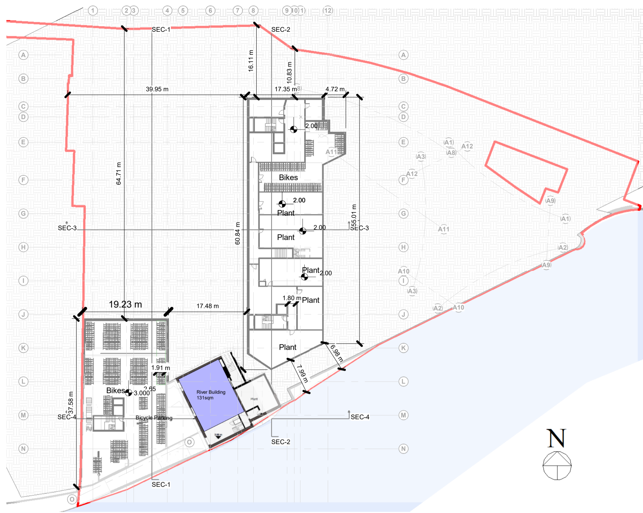
B01 - Proposed Lower Ground Plan Int. Amenity 1 : 500