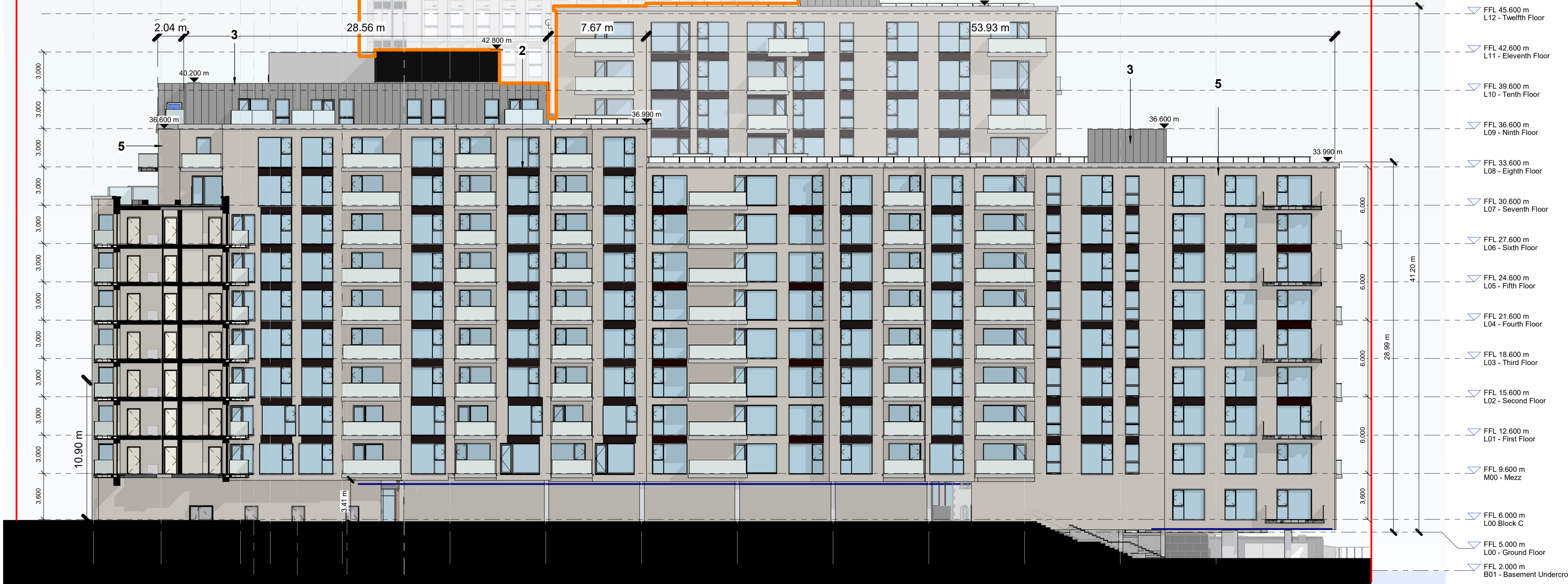
Proposed West Elevation 1 : 200